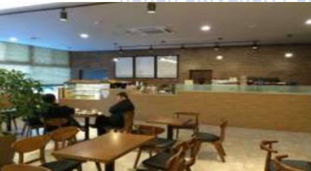
<Coffee shop: Dazzle / Building W, 1F>

You will have Western style breakfast and tasty Korean food during summer school. In addition, you can use cafeteria, snack bar, coffee shop and market.