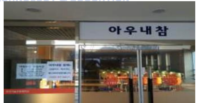
<Snack bar / Building S, 1F>