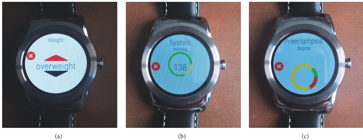
FIGURE 2: (a) Introducing input information with linguistic terms, (b) getting the measurement value from a wireless health device, including the fuzzification and representation of the value with a pie circle chart (green for normal and yellow for severe ), and (c) representation of the degree of preeclampsia with a pie circle chart (green for nonpreeclampsia , yellow for moderate preeclampsia , and red for severe preeclampsia ).