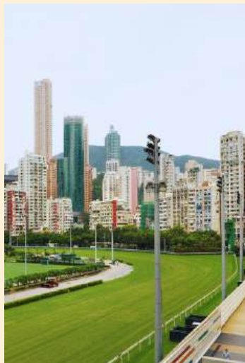
Happy Valley Racecourse