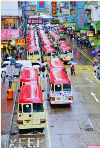
Mong Kok District