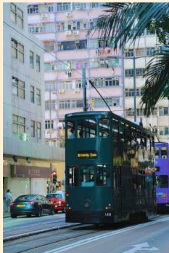
Kennedy Town Tram Terminus