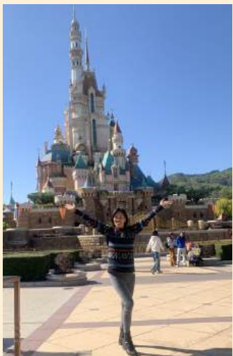
Hong Kong Disneyland