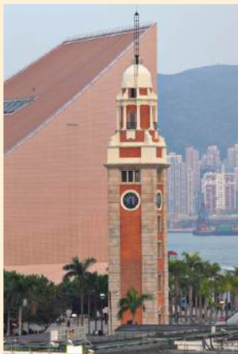
Clock Tower in Tsim Sha Tsui