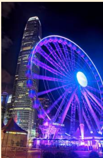
Hong Kong Observation Wheel