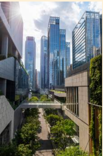
Shenzhen Greater Bay Area