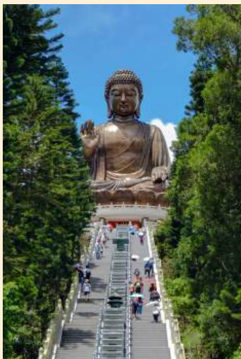
Tian Tan Buddha