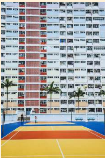
Choi Hung "Rainbow" Estate