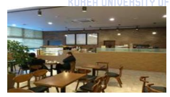
<Coffee shop: Dazzle / Building W, 1F>

You will have Western style breakfast and tasty Korean food during summer school. In addition, you can use cafeteria, snack bar, coffee shop and market.