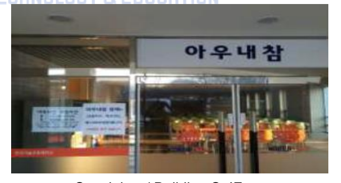
<Snack bar / Building S, IF>